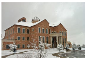
Winter at the Leeds School