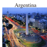
Argentina Brian Tupper

We will keep in touch and follow their blogs. Stop in our office as we skype in and learn about their experience!