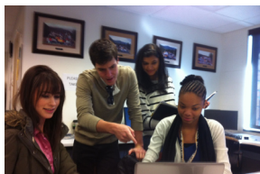
Students in the Diversity Office prepping for finals