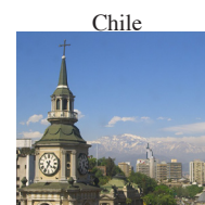
Chile Keah Beefu